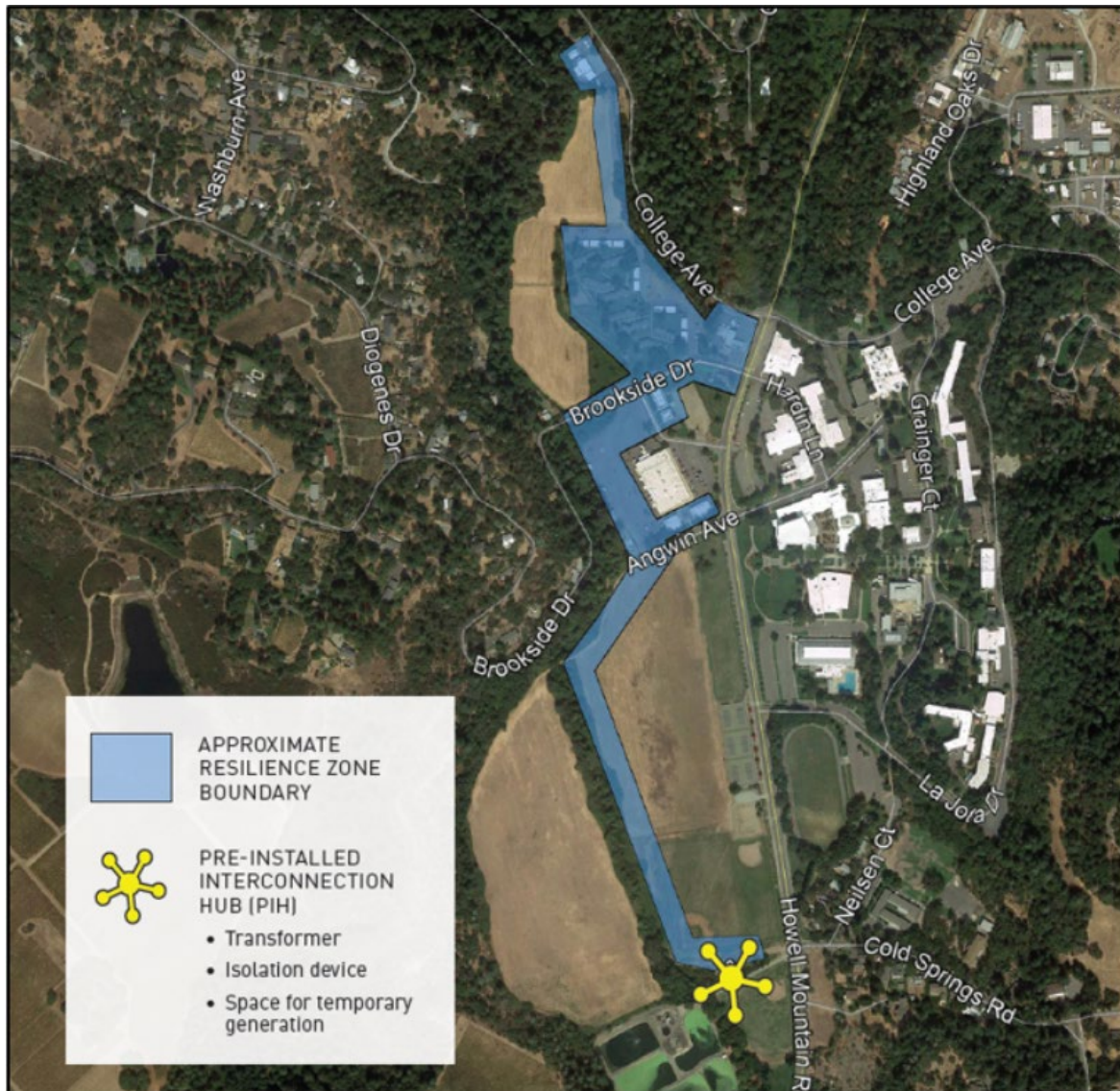
Figure 10: Map representing approximate area served by PG&E Resilience Zone in Angwin