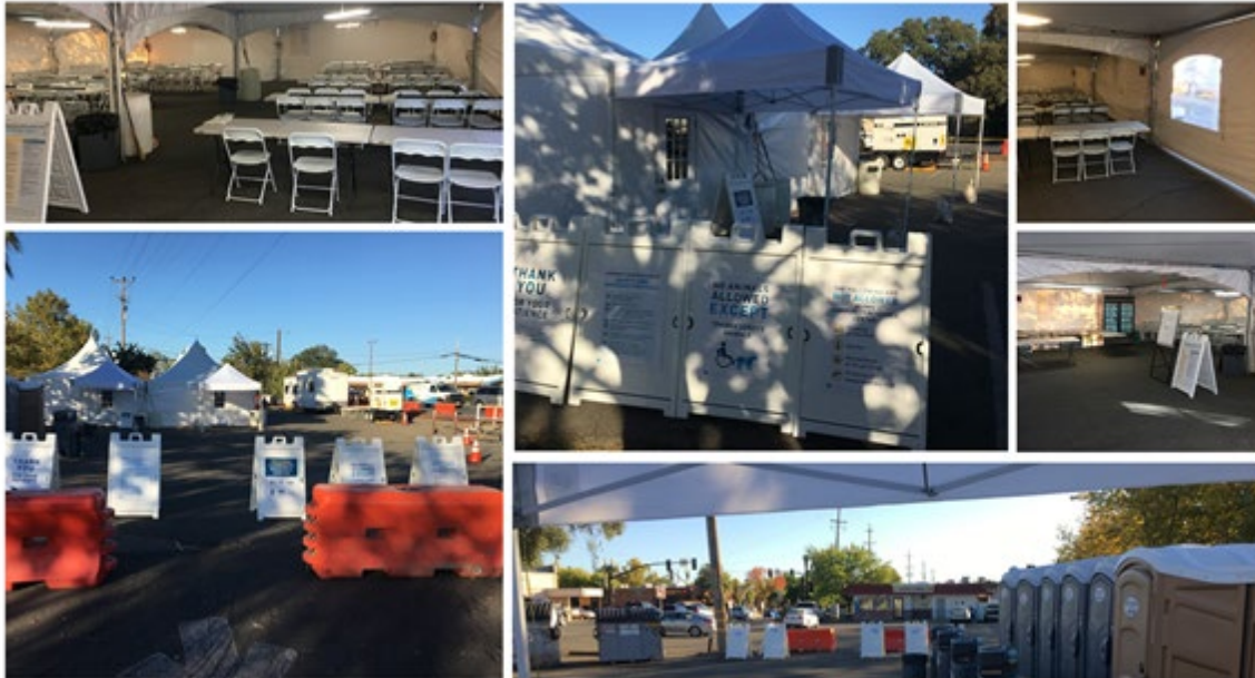
Figure 7. Calistoga/Napa: Calistoga/Napa Fairgrounds Parking Lot