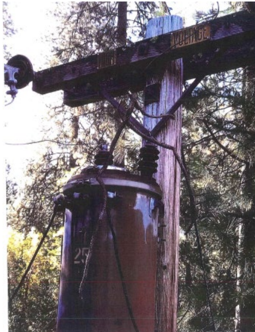
Figure 1-In Oroville, Butte County, a tree limb on a PG&E overhead transformer. Challenger 1102 circuit. Address: corner of La Porte Rd./Mulock Rd., in Oroville.

PG&E personnel patrolled all sections of de-energized PSPS circuits for locations Alpha and Bravo for safety prior to re-energizing. Damage and hazards discovered during PSPS patrols was assessed to determine whether it was attributable to the wind event. Any instances where there was insufficient certainty that the damage occurred due to the wind event have been excluded from these figures. During those patrols, PG&E discovered four instances of wind-related issues across impacted regions that required remediation prior to re-energizing. These included three instances of vegetation found on PG&E equipment – overhead transformer and conductors – and one instance of damage to PG&E conductors. PG&E cleared the vegetation hazards and repaired the conductors prior to re-energizing. Figure 1 below was found during patrols conducted after location Alpha, and figures 2-4 were found during patrol conducted after location Bravo.