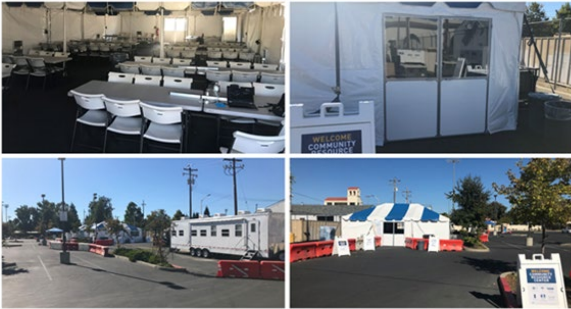
Figure 2. Grass Valley: Sierra College Grass Valley Campus Parking Lot